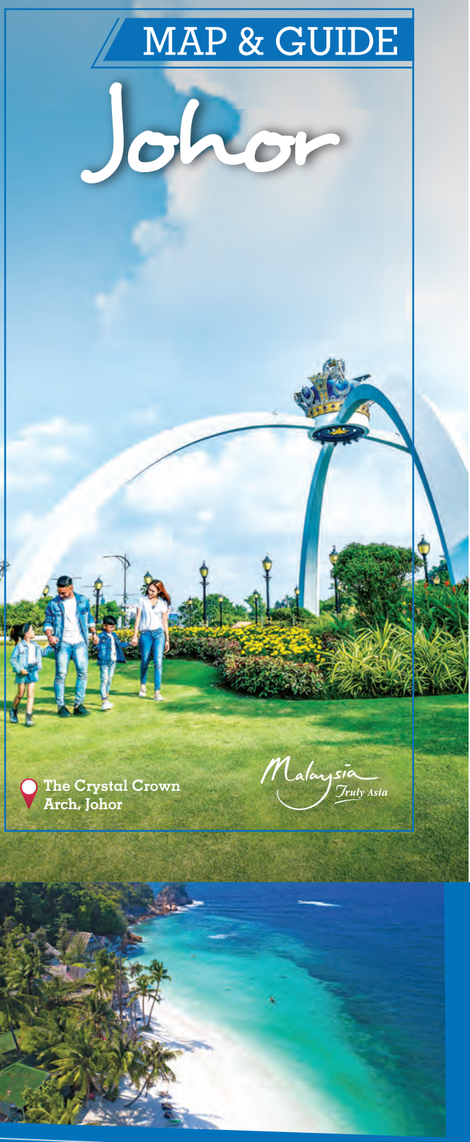
The Crystal Crown Arch, Johor

Published by Tourism Malaysia, Ministry of Tourism, Arts and Culture, Malaysia